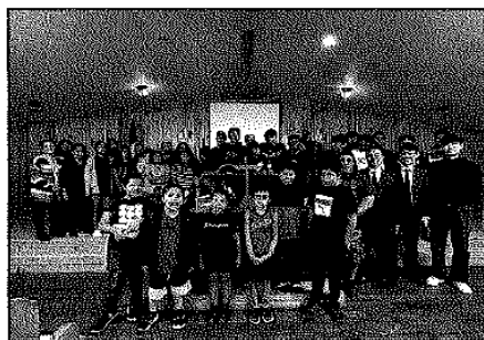
Youth from the church participated in the 2nd Annual Harvest Soul 3-Day Bible Camp located at the Wichita Community Church.

WCC supports youth who are at the core of its ministry.