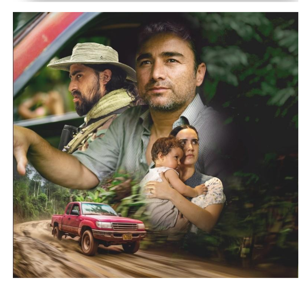
3 November 2024