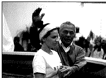
A baptism in the Belgorod-Dnistrovsky church in Odessa.