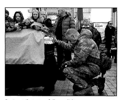
Paying tribute to a fallen solider.

From the first day of the full-scale invasion until now, we risk being on the verge of a humanitarian catastrophe. Therefore, social ministry-assistance to internally displaced persons, those who have lost their jobs, home, and breadwinners, - is in great demand by the public. Responding to it is the best manifestation of Christian sacrifice. The church has done it, is doing it, and will continue to do it.