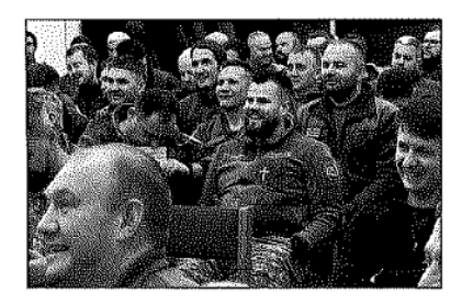
Soldiers gather to receive support and encouragement from Baptist chaplains.

While in the first year of the war, humanitarian service was more urgent and situational. This year it has gained stability, structure, and orderliness. Displaced people and residents of the frontline areas are still in dire need of our help with food, drinking water, hygiene products, and cash assistance. And in the last year churches have been more focused on learning how to provide psychological assistance