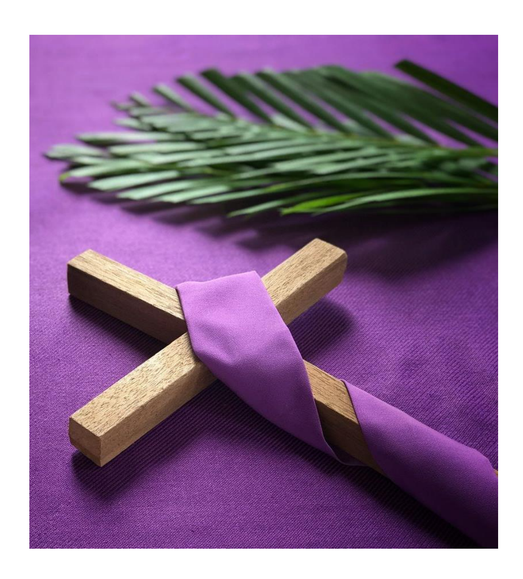
25 February 2024